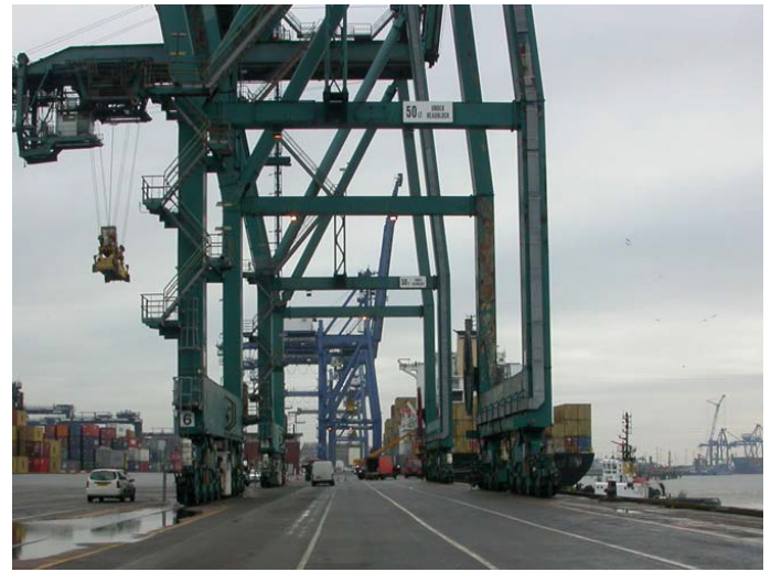
Looking south along Felixstowe dock side towards Languard Terminal and Dock Basin